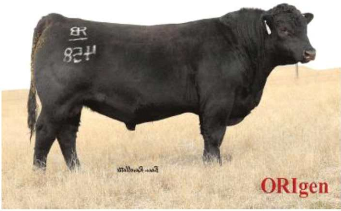
Sire for Lot 28