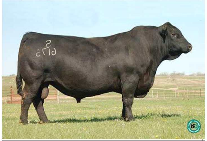
Sire for Lot 12

Reg # 15511451 Tattoo: 6175 DOB: 03/31/2006 Paws Up Alliance S Alliance 3313 Paws Up 9048 Emulation EXT S Chisum 6175 S Eclipse 169 S Gloria 464 S Gloria 209