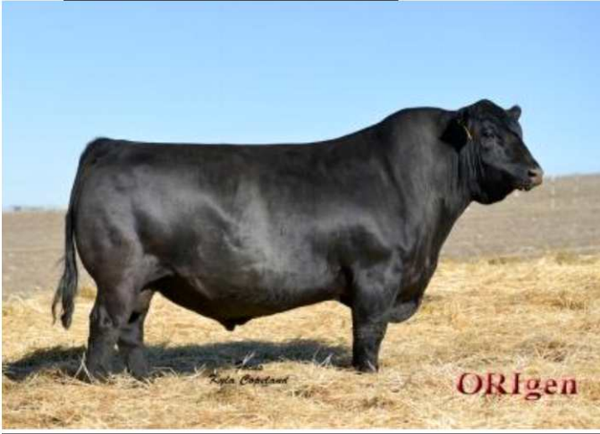
Sire for Lot 11

Reg # 17038724 Tattoo: 1682 DOB: 02/2011 Vermillion Payweight J847 Basin Payweight 006S Basin Lucy 3829 Basin Payweight 1682 HARB Pendleton 765 J H 21AR O Lass 7017 21AR O lass F24A