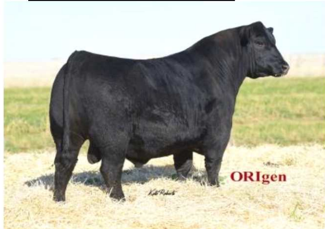
Sire for Lots 1 & 2

Reg # 17836370 Tattoo: 4081 DOB: 01/28/2014