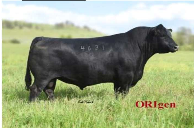
Sire for COMMERCIAL Lot 29

Reg # 17950219 Tattoo: 4631 DOB: 01/25/2014